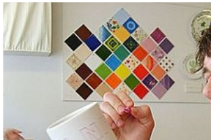
How to Paint Ceramic Mugs