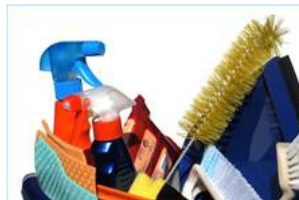
Guide to Enjoying Spring Cleaning