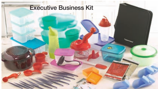
Executive Business Kit