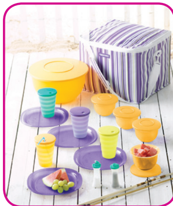
Picnic Starter Set $166 value. 8781 For $68 in Host Credit*