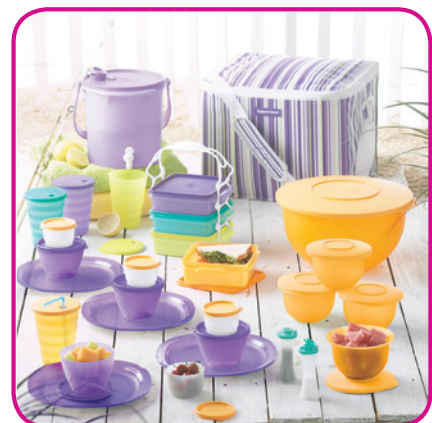
Picnic Complete Set $283 value. 8782 For $113 in Host Credit*

* Requires party sales to earn the Host Credit total plus 2 friends who date and hold their own parties. Future parties must be held within 21 days.