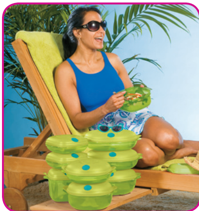
Heat 'N Serve™ 8-Pc. Collection $153.50 value. 8784 For $83 in Host Credit*